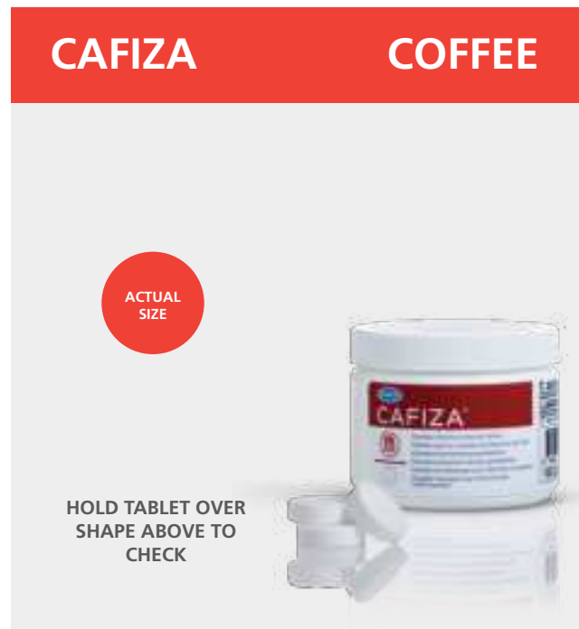
Part No: 12-ESPTH12-100