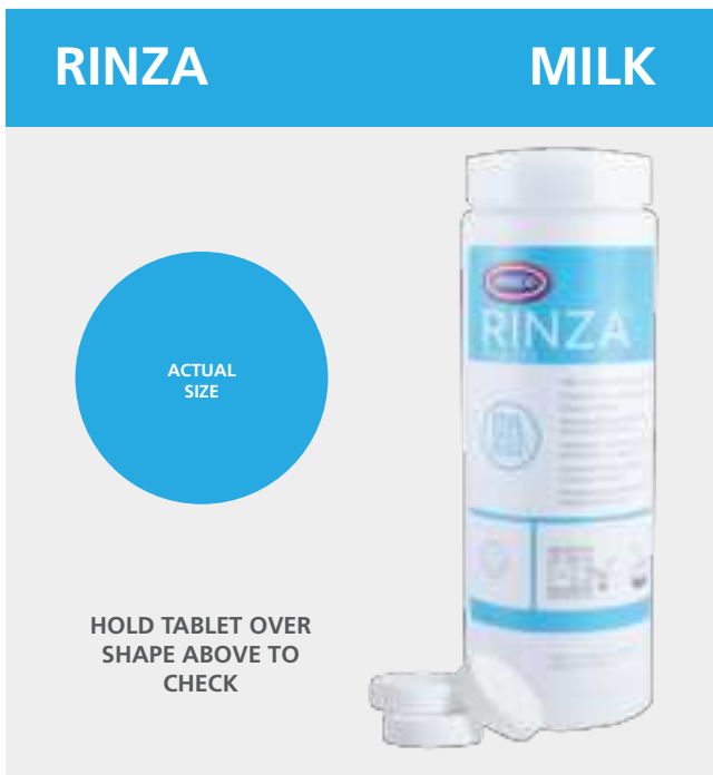
Part No: 12-MKTAB12-40