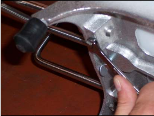
Figure 3. Pusher Head Adjustment Through the Blades.