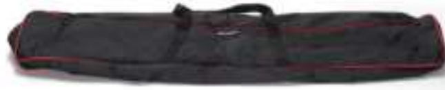
Jib Stand Bag