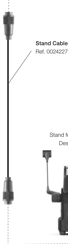
Stand Cable Ref. 0024227