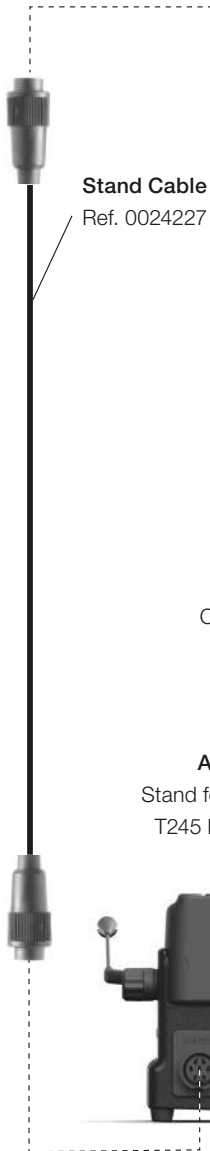
Stand Cable Ref. 0024227