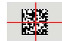
Relative Size and Location of Aiming System Pattern