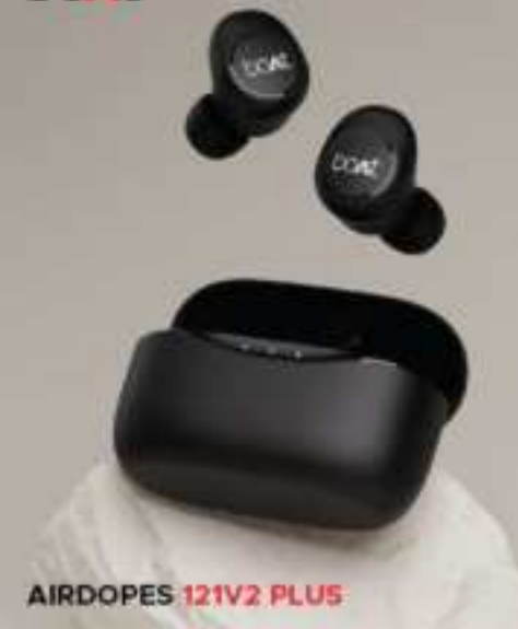
AIRDOPES 121V2 PLUS