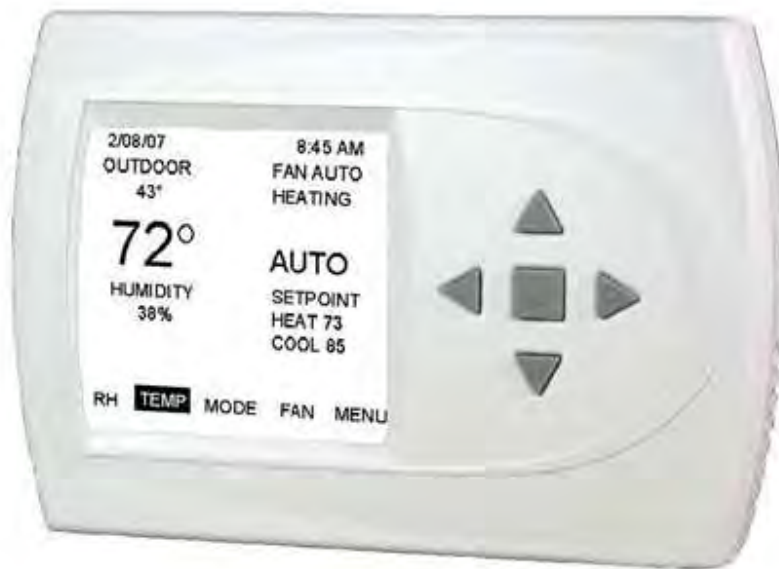
Menu Driven Display 1120-445A